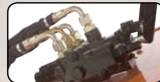
A four position manual valve easily controls the hydraulic feed roller