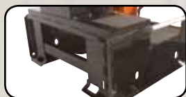
Two mounts for either front- or curb-side feeding