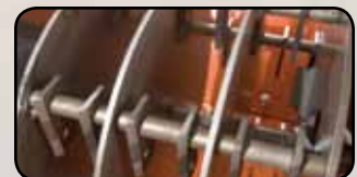
Easy access to the shredding knives and chipping disc