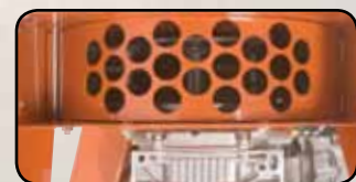
A 1.5" debris screen is standard with a .75" screen available