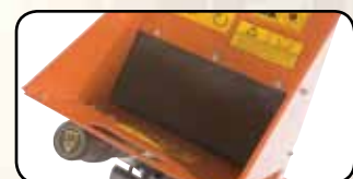
A large 15.75"x7.5" shredding chute easily accepts cumbersome branches